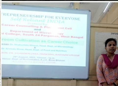
XF59+GQV, Block A, Kalyani, West Bengal 741235, India

Latitude 21.991943333333333° Longitude 88.441276666666667° Local 12:42:36 PM Altitude 6 meters GMT 07:12:36 AM Date Tue, 29 Aug 2023