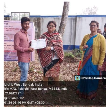
Raidighi, West Bengal, India RR+M7Q, Raidighi, West Bengal 743383, India Lat 21.991229° Long 88.440916° 19/01/24 03:46 PM GMT +05:30