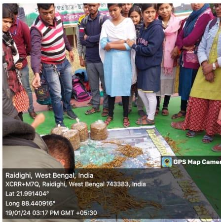
Raidighi, West Bengal, India XCRR+M7Q, Raidighi, West Bengal 743383, India Lat 21.991404° Long 88.440916° 19/01/24 03:17 PM GMT +05:30