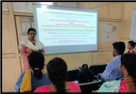
P.O.+P.S, XCRR+HCQ, Sub. Division: Diamond Harbour, Raidighi, India

Latitude 21.99171142° Longitude 88.44130368° Local 12:14:26 PM Altitude 6 m GMT 06:44:26 AM Tuesday, 29.08.2023