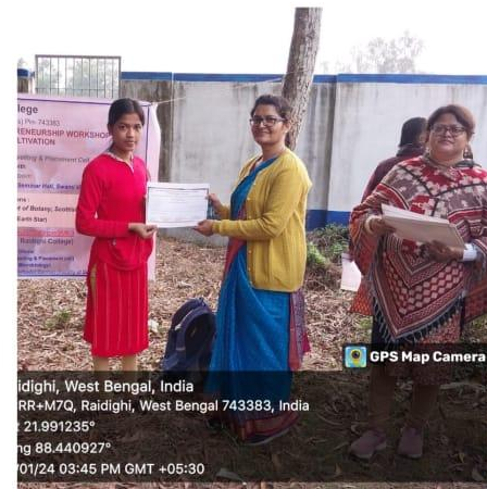
Raidighi, West Bengal, India RR+M7Q, Raidighi, West Bengal 743383, India Lat 21.991235° Long 88.440927° 19/01/24 03:45 PM GMT +05:30