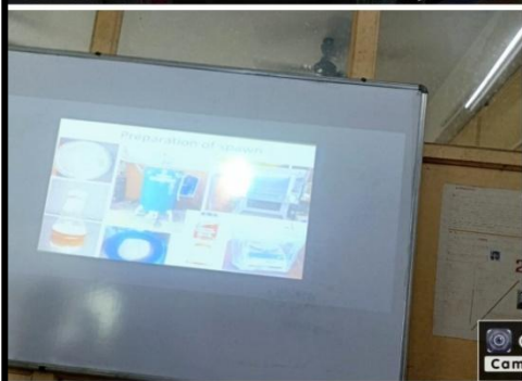
XCRR+V9H, Raidighi, West Bengal 743383, India

Latitude 21.99171142° Longitude 88.44136529° Local 12:14:26 PM Altitude 6 m GMT 06:44:26 AM Tuesday, 29.08.2023