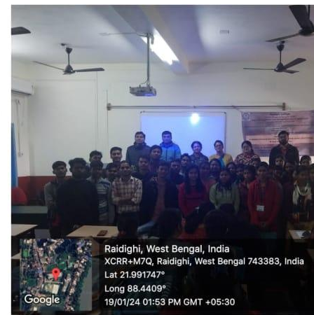
Raidighi, West Bengal, India XCRR+M7Q, Raidighi, West Bengal 743383, India Lat 21.991747° Long 88.4409° 19/01/24 01:53 PM GMT +05:30