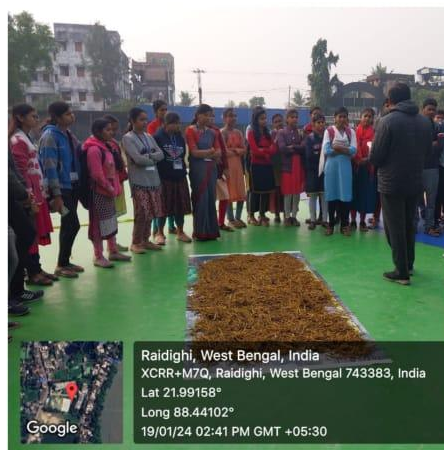
Raidighi, West Bengal, India XCRR+M7Q, Raidighi, West Bengal 743383, India Lat 21.99158° Long 88.44102° 19/01/24 02:41 PM GMT +05:30